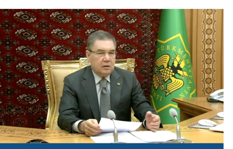
...we urge the world community to pay closer attention to the problems of the Aral Sea and the Aral region

The President of Turkmenistan H.E. G. Berdymukhamedov proposed adopting a UNGA resolution to ensure stable transportation during emergencies like the current pandemic; called for increased efforts to combat COVID-19, as well as to study the coronavirus genome under the WHO auspices; and drew attention to the problems of the Aral Sea region.