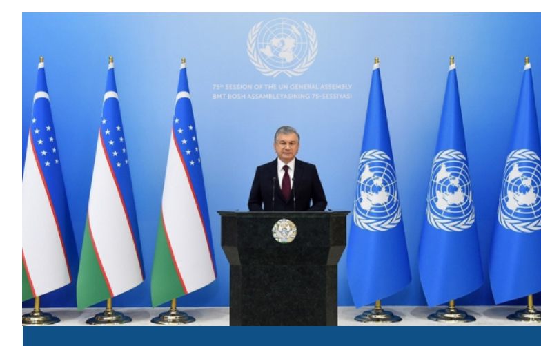
...negative developments also pose a great threat to the sustainable development of Central Asia

The Aral Sea region – an area of ecological innovation and technologies. [...] "Another acute problem of our time is related to global climate change. Today, every country feels the negative effects of this process. Unfortunately, such negative developments