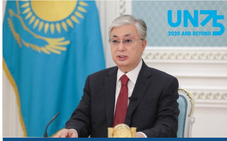
The emphasis must be shifted on the root causes, preventive measures, and increasing the efficiency of our limited resources

Regional Cooperation. [...] "Regional cooperation has always been our main focus and commitment. Central Asia is undergoing rapid transformation