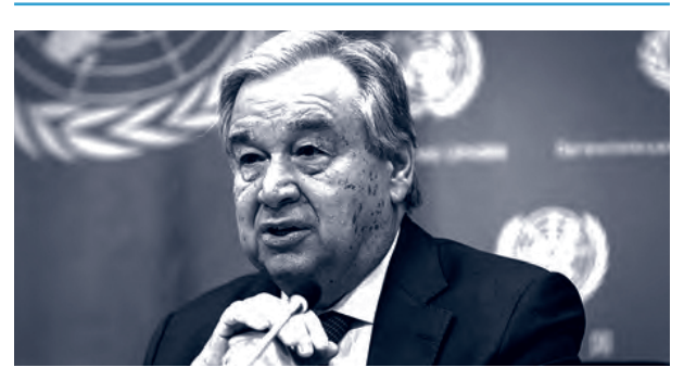
We must commit to building a more inclusive and sustainable world .

Each year, the Secretary-General reports on the work of the Organization, including priority areas of the UN's activity and future plans. 2020 Report highlights the work in the following areas: promotion of sustained economic growth and sustainable development; maintenance of international peace and security; development of Africa; promotion and protection of human rights; effective coordination of humanitarian assistance efforts; promotion of justice and international law; disarmament; drug control, crime prevention and combating terrorism. The Report presents critical results achieved to date and key transformations of the United to Reform Program, as well as key priorities for the Secretary General's work for 2019-2020: (1) 2030 Agenda and the decade of action (supported Governments and key stakeholders at all levels to kickstart the decade of action to accelerate implementation of SDGs by 2030); (2) climate action (ambitious action to combat climate change and its impacts, including through the 2019 Climate Action Summit initiatives, is vital to achieving the 2030 Agenda and the