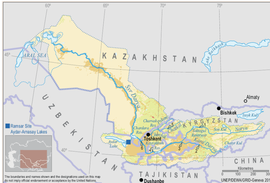
Figure 1: Syrdarya river basin

seasons (FES 2004). The domination of energy use upon irrigation (one) in the Toktogul caused numerous visible damages to the downstream countries. For instance, the cotton and wheat fields did not get enough water during the spring-summer seasons and the irrigation areas were flooded as a result of vast water discharge during the autumn-winter months.