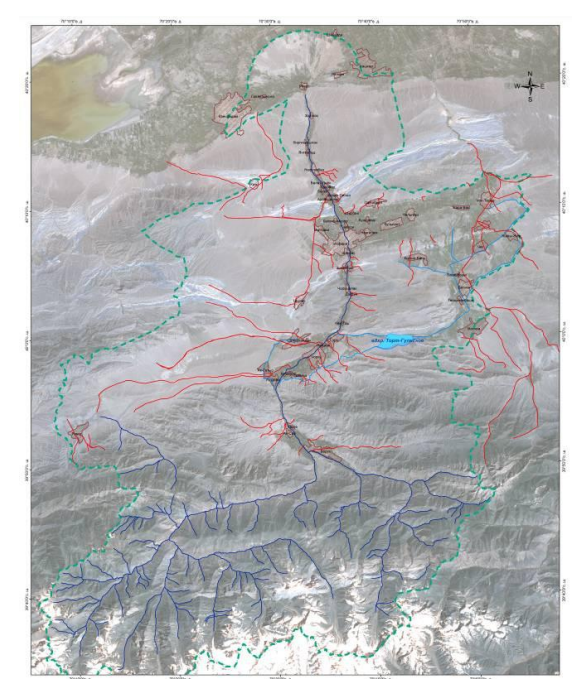
Preliminary mudflow risk zones map of the Isfara river

Preliminary land resources use map of the Isfara river basin