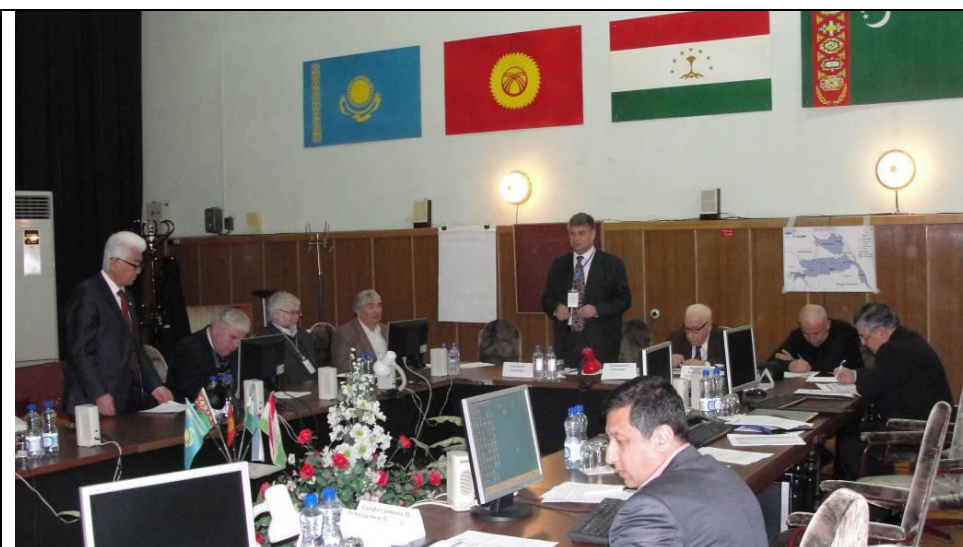
Working moments during the national consultations in Training Center of ICWC on 11 March, 2013