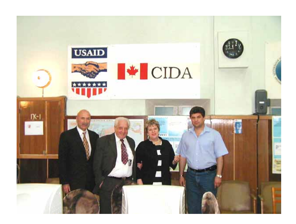
Photo: Management of the SIC ICWC and ICWC Training Center together with the GWP Chair Mrs. Margaret Catly-Carlson

The basic training strategy is the popularization of IWRM concepts and embedding them in the national action plans of reforming the national water sectors. Active participation of the leaders of national water sectors - ICWC members in the training courses has provided all-round support to social mobilization of water users and all stakeholders and the preparation of national IWRM action plans with the their follow-up approval by national governments. Such a training strategy was also aimed at raising the public awareness of the need in seeking inexpensive solutions and non-governmental funds for improving the water sector through developing new forms of institutions and public participation. All these actions have facilitated the advancement of IWRM and its recognition in national legal and normative documents.