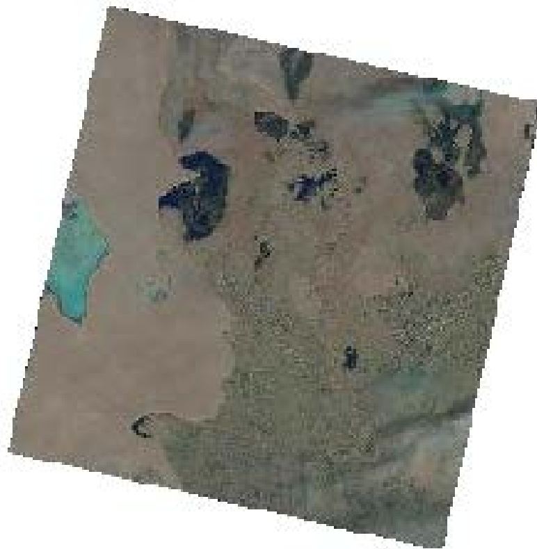
Figure 2 The Aral Region, Landsat 8, 22 March 2020