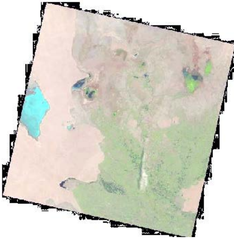
Figure 2 The Aral Region. Landsat 8, 24 June 2022.