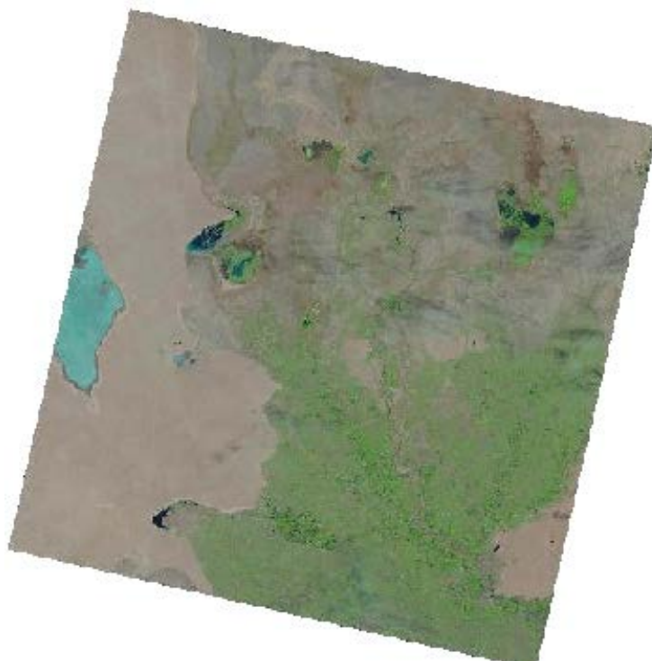
Figure 2 The Aral Region. Landsat 8, 31 July 2021.