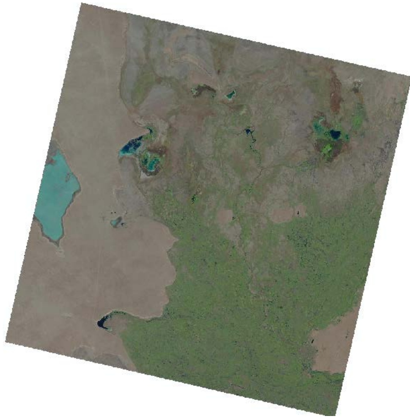
Figure 2 The Aral Region. Landsat 8, 29 April 2022.