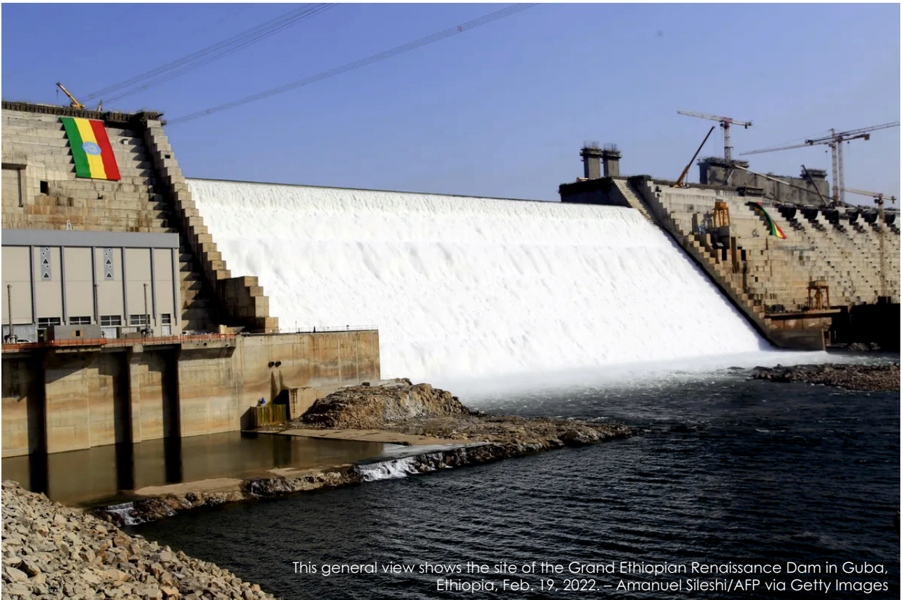
This general view shows the site of the Grand Ethiopian Renaissance Dam in Guba, Ethiopia, Feb. 19, 2022.

flow. Egypt accuses Ethiopia of filling the dam's reservoir without articulation with Egypt or Sudan, which would violate international law. It also urged the Council to intervene in order to bring Ethiopia to the negotiations table. The enormous $4.2bn dam has been at the centre of a regional dispute ever since Ethiopia broke ground on the mega project in 2011. Ethiopia announced in mid-June that it had completed 88% of the construction work on the GERD, and is looking forward to the actual completion of its construction by the end of 2023.