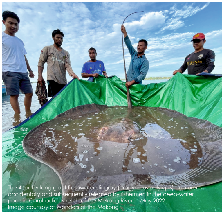
The 4-meter-long giant freshwater stingray ( Urogymnus polylepis ) captured accidentally and subsequently released by fishermen in the deep-water pools in Cambodia's stretch of the Mekong River in May 2022.

An underwater expedition has confirmed the presence of some of the world's largest and most threatened freshwater fish in a remote and barely studied stretch of the Mekong River in northeastern Cambodia . The findings included a 180-kilogram (400-pound) giant freshwater stingray . In addition to the endangered giant stingrays ( Urogymnus polylepis ), the area is thought to be home to Mekong giant catfish ( Pangasianodon gigas ) and giant barb ( Catlocarpio siamensis ), both of which are listed as critically endangered on the IUCN Red List.