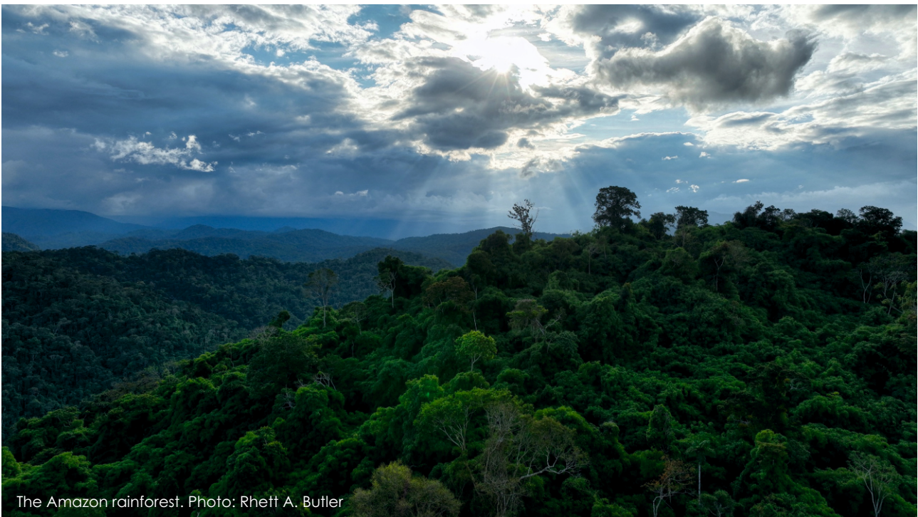
The Amazon rainforest.

One of the most important developments for tropical rainforests in 2022 was Brazil's presidential election of Luiz Inácio Lula da Silva. Lula, who presided over a sharp drop in Amazon forest deforestation during his terms in office between 2003 and 2010, made saving the Amazon a central part of his bid for the presidency, pledging to rehabilitate Brazil's international standing on climate and environmental issues. Brazil's National Space Research Institute released preliminary figures showing that deforestation in the Brazilian Amazon amounted to 11,568 square kilometers for the year ended July 31, 2022, a 11% drop from last year, when Amazon forest loss breached 13,000 square kilometers, the highest level in 15 years. Despite the apparent drop in deforestation, an analysis by the Monitoring of the Andean Amazon Project concluded that the eastern third of the Amazon may have already passed a critical threshold for forest loss. That region is especially important because of its role in driving moisture from the Atlantic to the central Amazon.