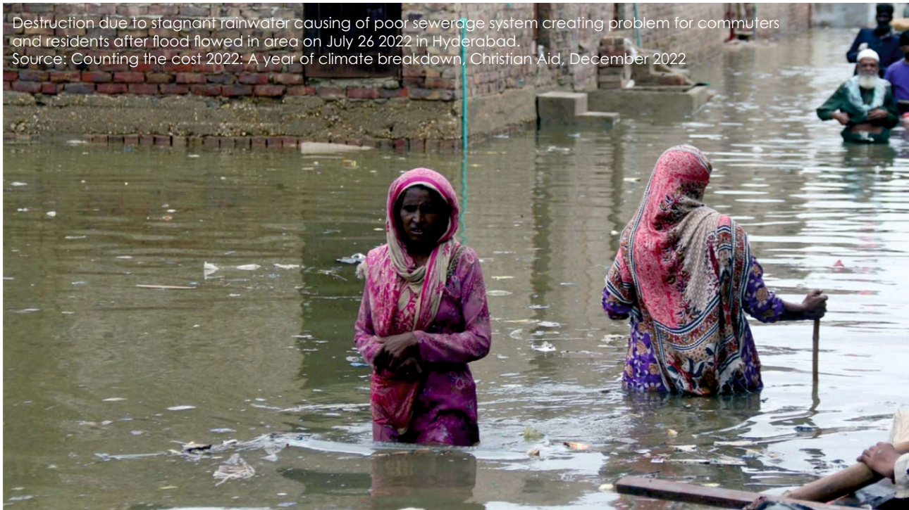
Destruction due to stagnant rainwater causing of poor sewerage system creating problem for commuters and residents after flood flowed in area on July 26 2022 in Hyderabad. Source: Counting the cost 2022: A year of climate breakdown, Christian Aid, December 2022

Source: Counting the cost 2022: A year of climate breakdown, Christian Aid, December 2022