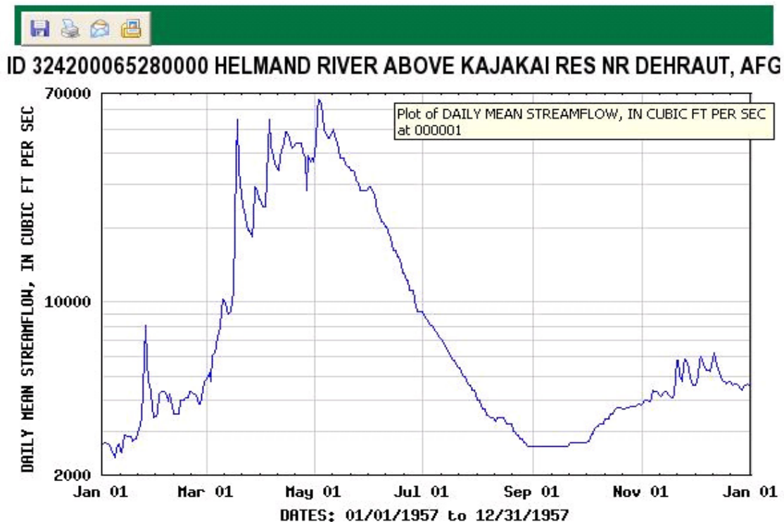
Figure 2. Daily streamflow for the Helmand River above Kajakai Reservoir near Dehraut, Afghanistan.

Afghanistan has plans to modernize and rehabilitate the hydrologic and meteorologic networks in Afghanistan and the